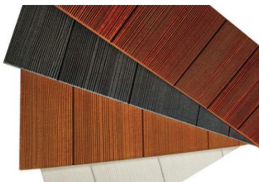
Figure 1. "Sierra Premium Shake"

Examples of “Sierra Premium Shake” and “Savannah Smooth” product are shown in Figures 1 and 2, respectively. The product is installed as horizontal lapped planks.