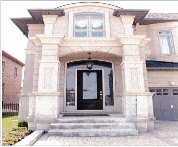
Figure 2(a). "CANAMOULD™ Exterior Mouldings"