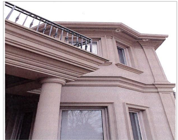
Figure 2(d). "CANAMOULD™ Exterior Mouldings"