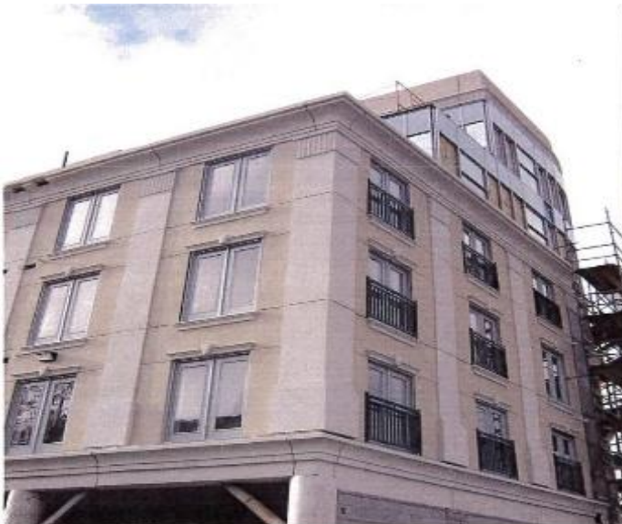
Figure 2(e). "CANAMOULD™ Exterior Mouldings"