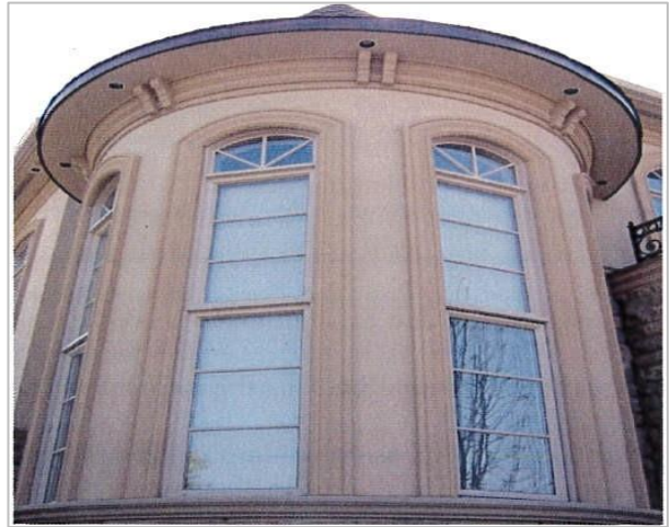
Figure 2(b). "CANAMOULD™ Exterior Mouldings"