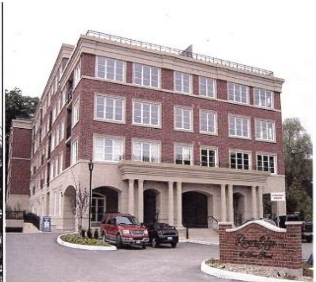
Figure 2(f). "CANAMOULD™ Exterior Mouldings"