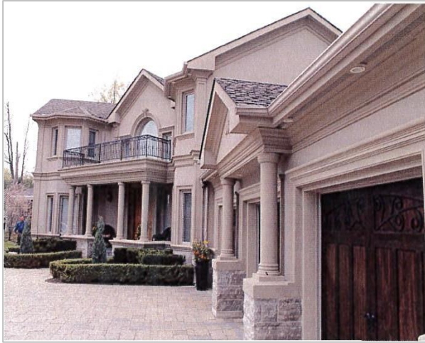
Figure 2(c). "CANAMOULD™ Exterior Mouldings"