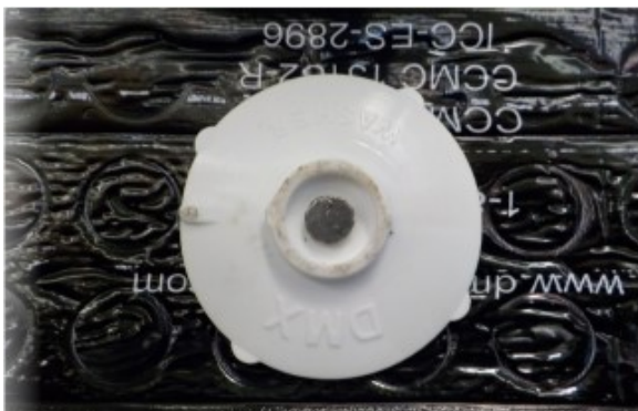
Figure 2. Anchor