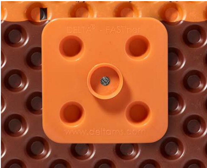
Figure 3. Dörken DELTA®-MS dampproofing membrane – anchor